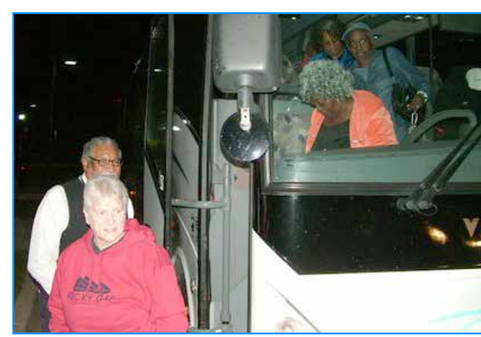
The guests depart the bus upon their return to Largo.